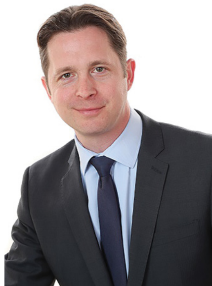
MP Alex Burghart