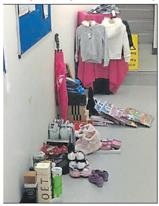
■ The items stolen included alcohol, trainers and clothes